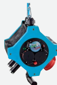
Power and air supply unit