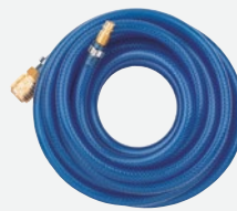
High pressure hoses