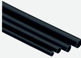
PA pipe - black