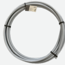
PA rolled pipe