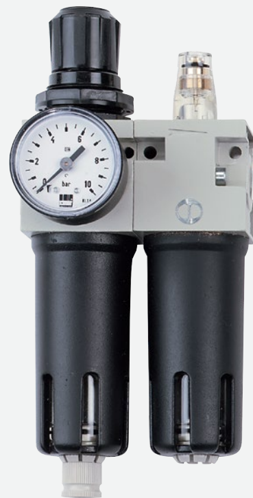
Filter regulator - Lubricator